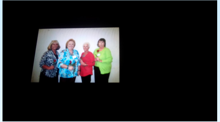
Gamma Chapter Officers